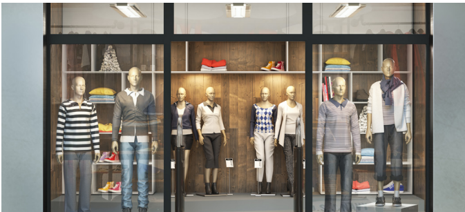
SMALL BUSINESS & RETAIL

With a determination for development, Carrier has a mission to be creative and resourceful, delivering modular and scalable solutions, which are technologically advanced, dependable and reliable, and without compromise whatever the property we are helping to protect.