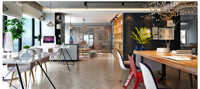
LARGE SCALE PROJECTS